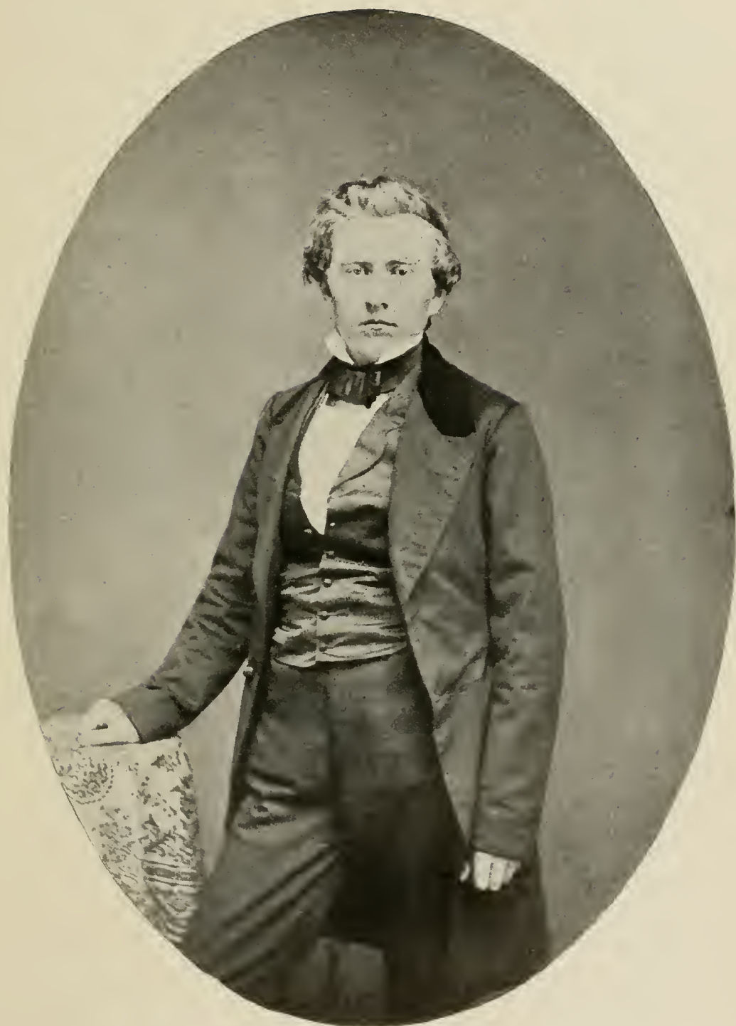
J. STERLING MORTON, 1858.