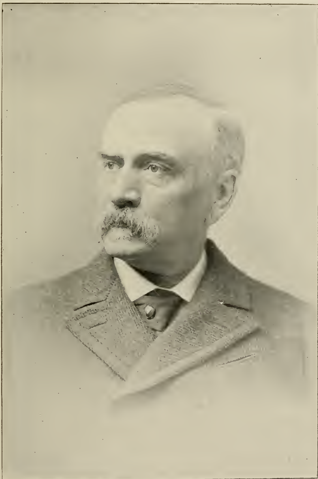
J. STERLING MORTON, 1896.