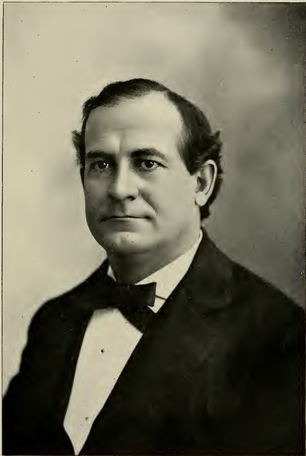
W. J. BRYAN.